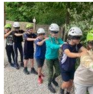
Robin Wood residential March 2021