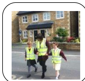
Y1/2 –Life Bus Visit & Right Start Road Safety