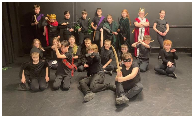
Y5/6 perform Macbeth for the Shakespeare Schools Festival March 2022