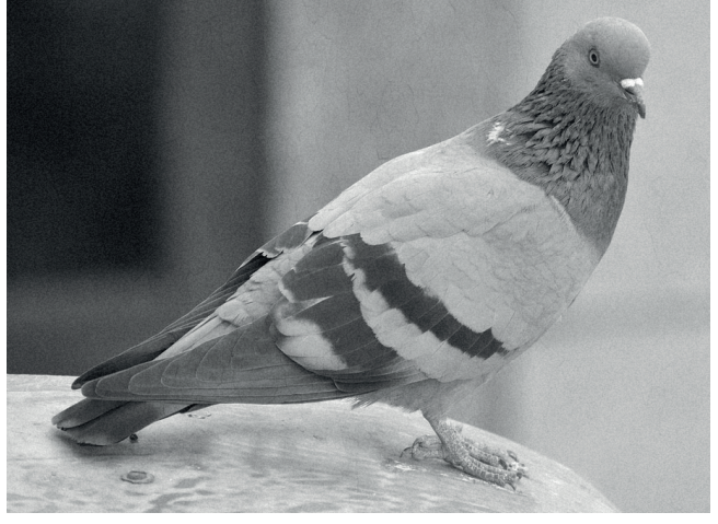
it was joyously received, and the raid cancelled.

It was almost too late. It was only as the planes were warming up that the news arrived. Luckily,